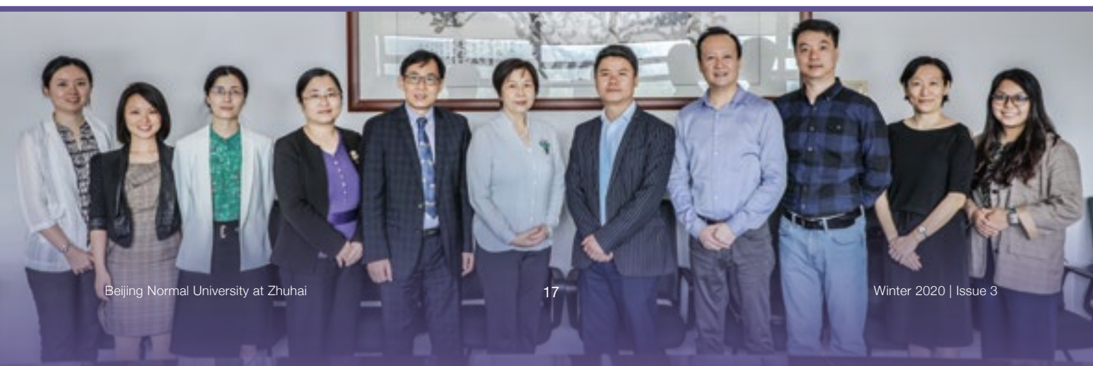
Beijing Normal University at Zhuhai

Saint Paul School, founded in September 1971, is one of the seven Diocesan Schools in Macao. The School has a unique place in the history of education in the region. With a population of about 3,000 students in its three levels, Kindergarten, Primary and Secondary, Saint Paul School is one of the five schools with the most students in Macao. It is considered as one of the schools with the most advanced educational programs of the region. Saint Paul School holds one of the largest programs of one tablet PC per student in Asia. The School's innovative approach to ICT deployment on such a big scale through its "Classroom 2012" project has received praise from both the press and experts in the field of education.